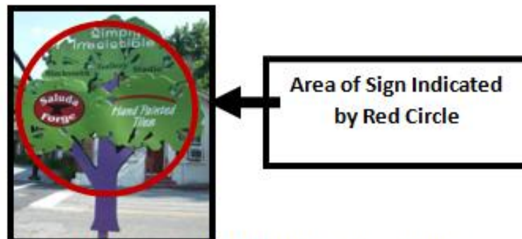
Example Illustrating Measurement of the Area of an Irregularly Shaped Sign

SIGN AREA. The size of a sign in square feet as computed by the area of not more than two standard geometric shapes (specifically circles, squares, rectangles, or triangles) that encompass the shape of the sign exclusive of the supporting structure.